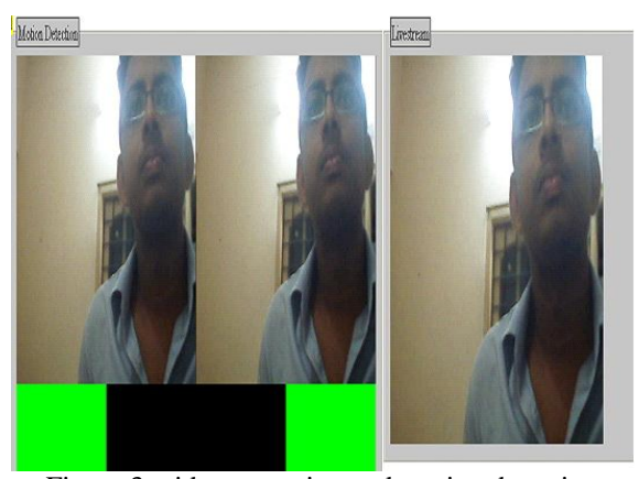
Figure 3: video capturing and motion detection

Each of these standards is well suited for particular applications: JPEG for still image compression, H.261 for video conferencing, and MPEG for high-quality, multimedia systems.